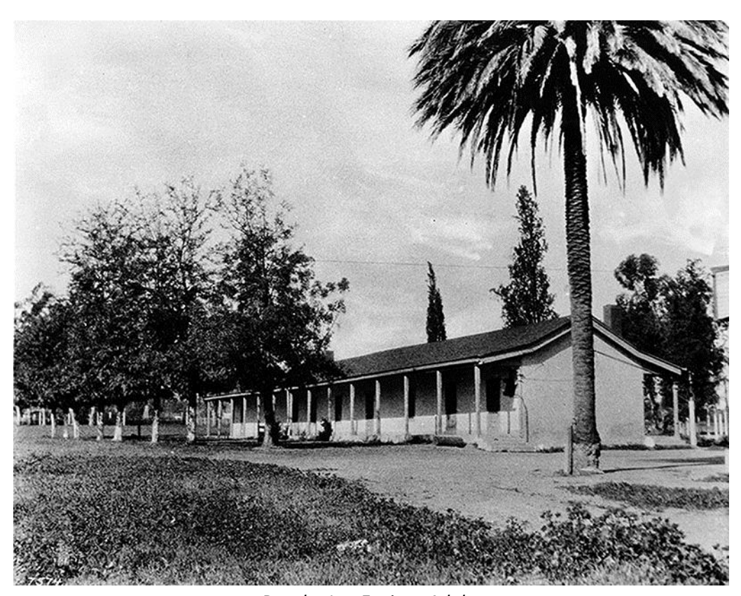
Rancho Los Encinos Adobe California Historical Landmark, National Register (Los Angeles Public Library)

A prime example of this openness was the Pico family. Under the Spanish casta system the paternal grandmother had been listed as a mulata , of mixed race with African ancestry, and the paternal grandfather as a mestizo , or mixed Spanish and Native American blood. They had several sons, all but one of whom were listed as a mulato . One son, the father of Pío and Andres, was listed as a Spaniard. This category was earned, most likely, as a reward for exemplary military service to the Crown. Pico was a prime example of the fact that wealth and comportment, rather than ethnic background alone, determined status and rank among the Californios .<sup>76</sup>