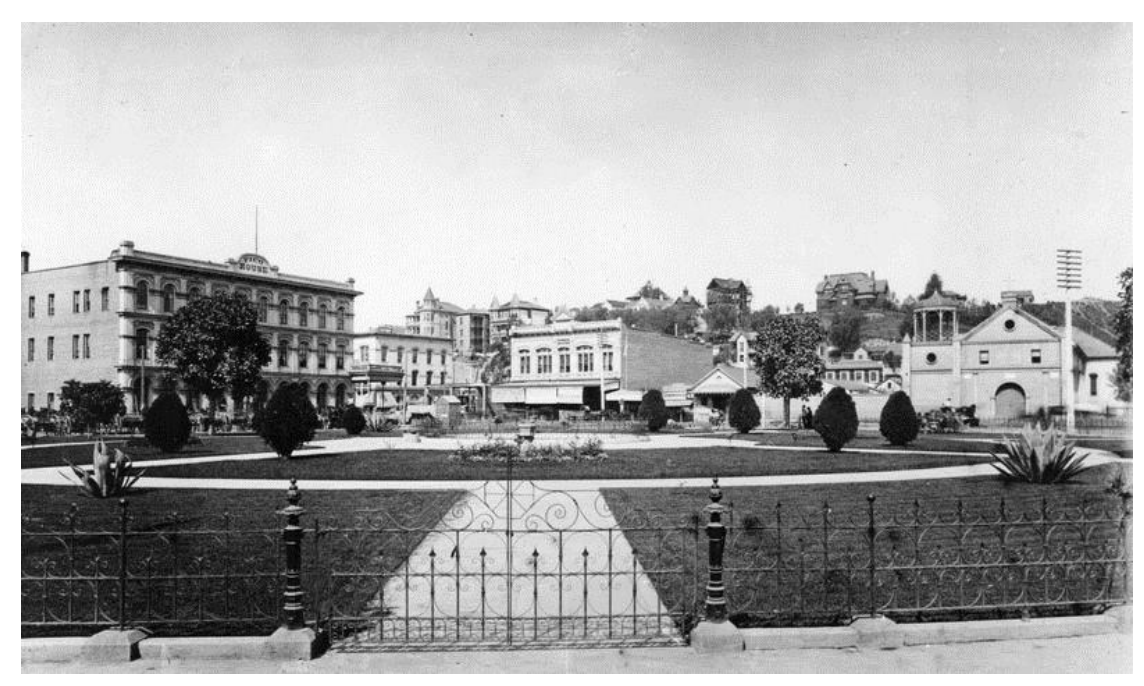
Plaza, Photo circa 1890 Pico House on Left, Plaza Church on Right

The third inheritance is the idea of the plaza as a public space. The Hispanic plaza is in essence an empty outdoor room. Its emptiness allows for a variety of functions, which in traditional Iberian society ran from religious festivals to public executions. This concept of an empty public space was one that Anglo-Americans found difficult to accept. Anglo-American society has instead held up the ideal of the public square filled with a monumental structure, such as a courthouse, or transformed into a park with walks and benches set among elaborate landscaping.