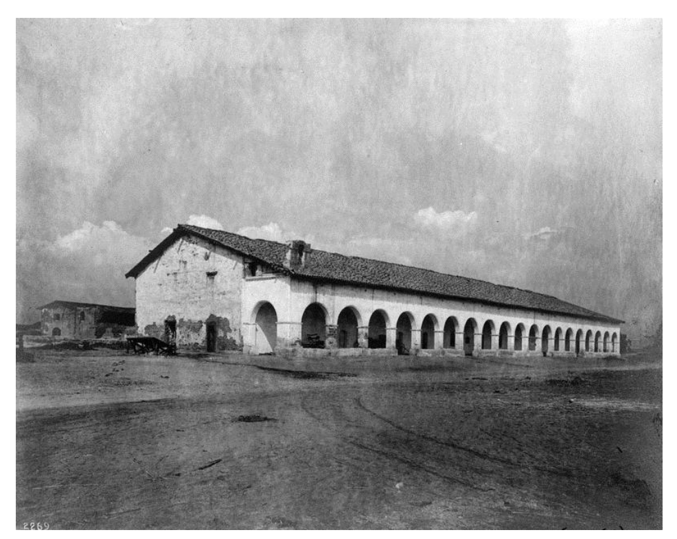
Mission San Fernando, Photo circa 1890s Church in Left Background, Convento in Foreground L.A. Historic-Cultural Monument, California Historical Landmark, National Register (Los Angeles Public Library)

One mission is within the current boundaries of Los Angeles. It is the Mission San Fernando Rey de España (L.A. Historic-Cultural Monument No. 23, California Historical Landmark No. 157, listed in the National Register). Mission San Fernando was dedicated to Father Lasuén in 1797. The church was constructed in 1806 and rebuilt after an earthquake in 1812.